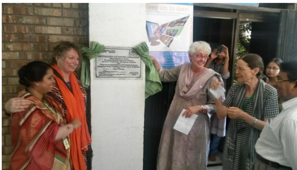
SISTER LIBRARY CEREMONY APRIL 13, 2014